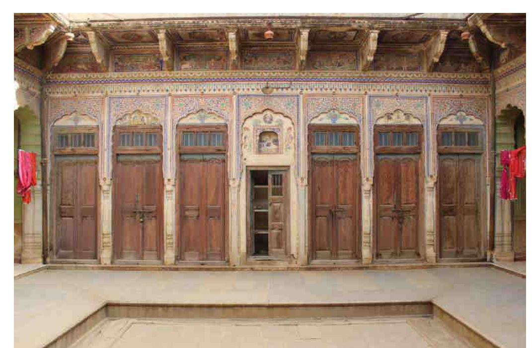
The Koolwal Haveli, Nawalgarh