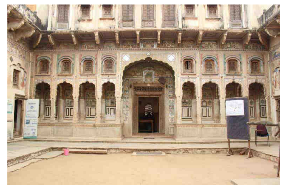
The Utaara Haveli, Nawalgarh