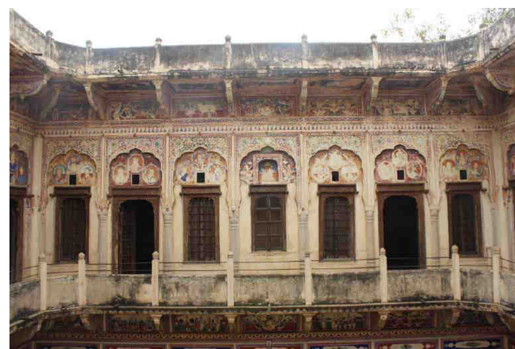
The Morarka Haveli, Nawalgarh