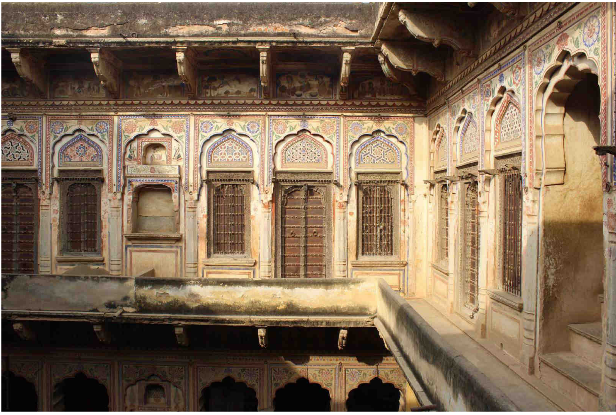
A haveli in at Nawalgarh, Rajasthan

'Shekhawati', meaning the land of Shekha's den, derives its name from the ruler Rao Shekha, of the Kachhwaha family of Jaipur. Located towards the north of Rajasthan, it comprises of significant towns like Nawalgarh, Sikar, Jhunjhunu, Lakshmangarh, Fatehpur and so on. Shekhawati consisted mostly of mercantile settlements. These affluent traders and merchants constructed lavish havelis replete with ornamentation, murals, frescos, as well as paintings in the towns of Shekhawati.