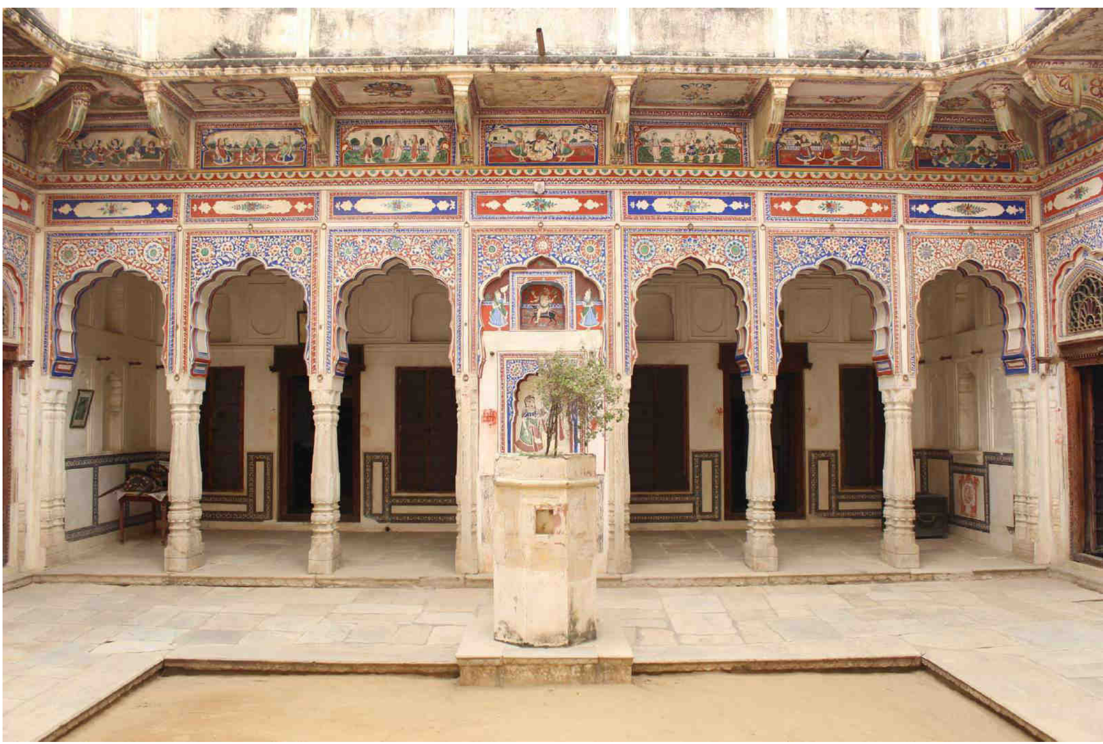
The Morarka Haveli, Nawalgarh, Rajasthan

The research aims at understanding whether surface rendering is truly just an overlay for aesthetical purposes as it is often considered to be or does it reciprocate by adding a language to the space.