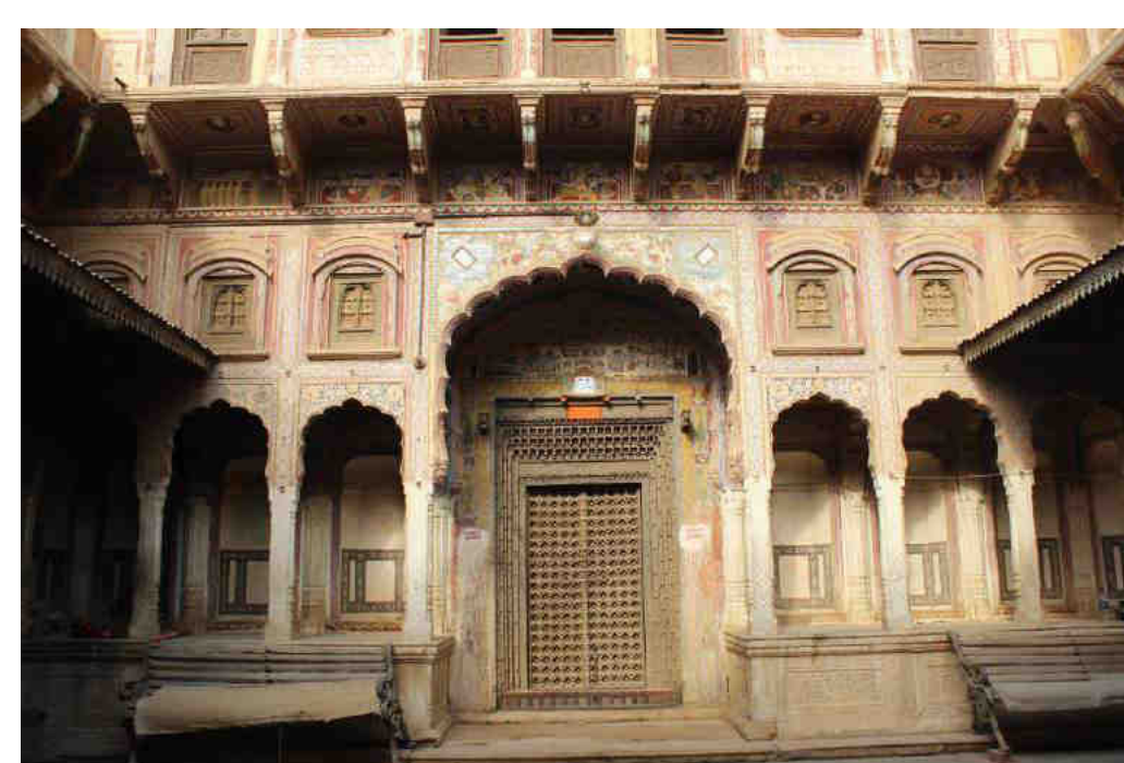
The Bhagat Haveli, Nawalgarh